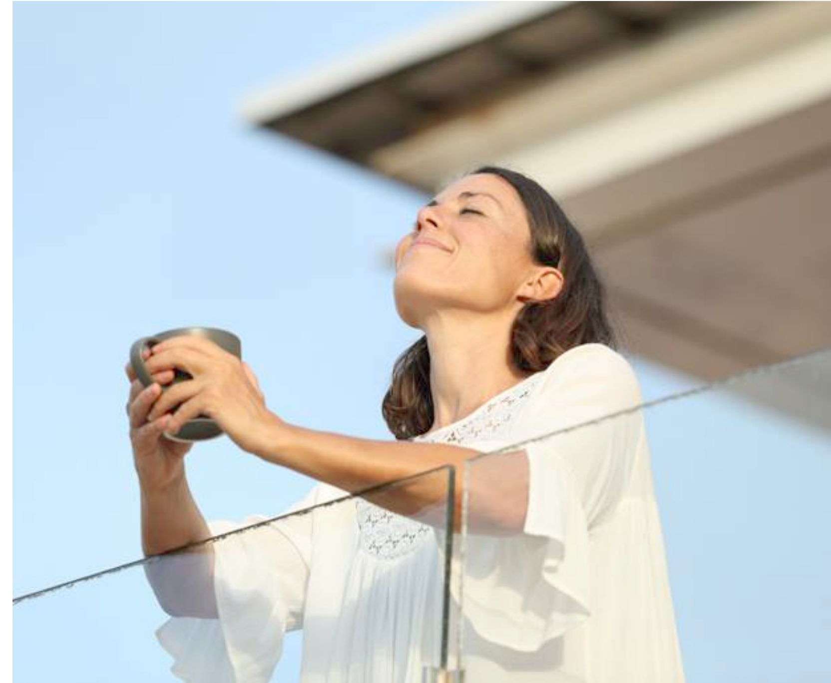
Sun shading elements (balconies & perforated panels)

Extensive landscaping with native plants or adaptable species enhances the property's beauty and value while reducing its environmental impact. Other environmentally friendly features include advanced waste management and water reuse solutions, as well as a bicycle storage area and EV parking to encourage residents to use less traditional combustion engines.